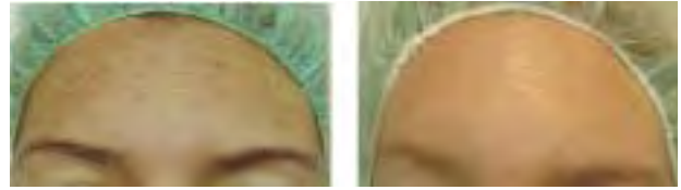
Fig. 4b: AFT 540 + 570nm handpieces

monotherapy, both in safety and efficacy. As the results of these studies become available, a surge in the popularity of combined therapy is expected, with more practitioners offering combination treatments and increased consumer demand for such services.