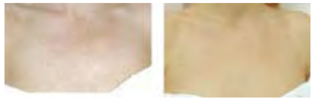
Fig. 4c: AFT 540 + 570nm handpieces