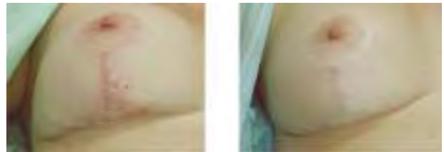
Fig. 4d: Laser LP Nd:YAG 1064nm + AFT 540nm handpieces