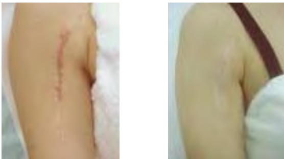
Fig. 4a: Laser LP 1064nm Nd:YAG + AFT 540nm handpieces

Combined therapy and the use of different handpieces in various procedures help refine the quality of the final results. It is important to initially treat (based on the lesion diagnosis, color, depth and location) superficial lesions using the shorter wavelength handpieces, and continue to deeper epidermal-dermal lesions using the near infrared laser. Perhaps the most popular of these procedures today is the combination of nonablative photorejuvenation treatment (pulsed light and laser). Using the full potential of the Harmony, photorejuvenation is not just skin rejuvenation and wrinkle reduction. We compliment the treatment with the removal of unwanted facial hair, acne and soften or eliminate acne scars. Pigmented and vascular lesions and other cosmetic and aesthetic imperfections can now be treated easily and effectively, resulting in higher patient satisfaction. Examples of the various results achieved through combined therapy with the Harmony system are shown in Fig 4a - 4d.