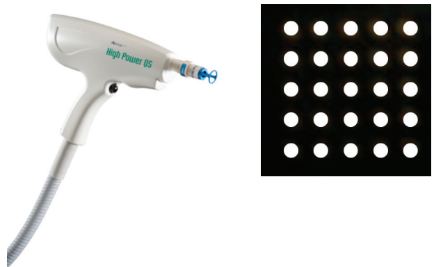
Figure 1. High Power Pixel QSW Nd:YAG 1064-nm laser hand piece and its 5x5 pixel matrix on a 0.5 x 0.5 cm footprint.

The new Pixel QSW module is a fractional, high power, short pulse, 1,064nm Nd:YAG laser used with the Harmony XL platform (Alma Lasers Ltd., Caesarea, Israel). Since the Q-Switched 1,064-nm wavelength laser beam is only modestly absorbed in melanin and hemoglobin, it enables deep penetration to the papillary and reticular dermis. The laser beam is fractionated by a passive refractive optical element, creating a 5x5 matrix of 25 microscopic holes (~200µm in diameter) and distributed within a 5mm x 5mm footprint (Figure 1).