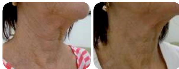
Before and 3 months after 3 treatments