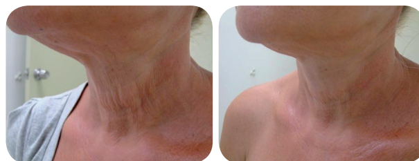
Before and 3 months after 3 treatments